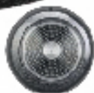
Induction compatible bottom