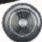
Induction compatible bottom